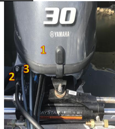
White Safety Box / Floatation Box is at helm