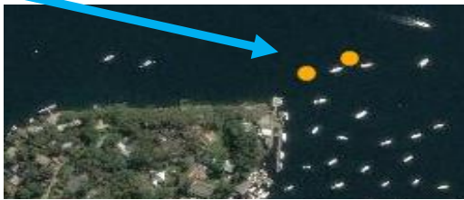
Cottage Point 2 x Public Moorings