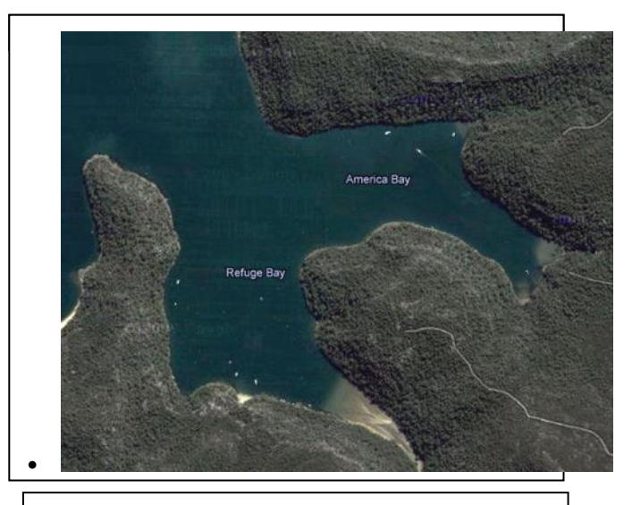
Brooklyn Marina Moorings – Approximate location

Spare boat hook is behind the stairs (pull stairs out) . Replacement of mooring pole is $35